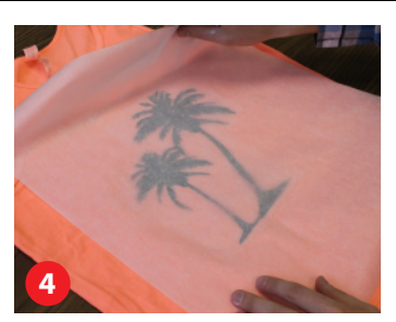
Use a cover sheet, such as parchment paper or a heat transfer cover sheet