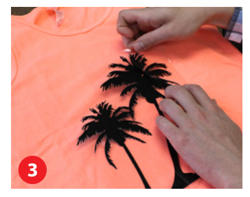
Place transfer on the garment as desired