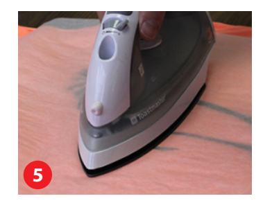
Use FIRM pressure for 10 seconds cover entire image DO NOT SLIDE IRON