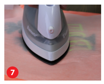
Use a cover sheet and reheat for another 5-10 seconds