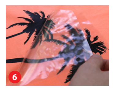
Remove the clear polyester carrier